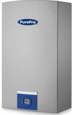
PurePro TL-Pro tankless water heater